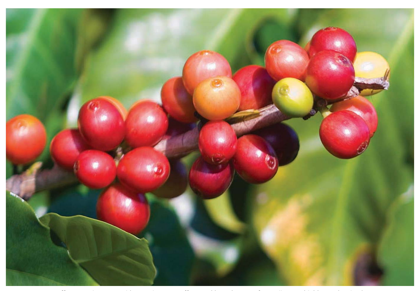
Coffee connoisseurs consider MauiGrown Coffee's Mokka to be one of Hawaii's most highly rated varietals.

coffee connoisseurs for its smoky, hazelnut-edged chocolate flavor. These are milled into "green coffee" which can be sold to wholesalers for roasting or retailed under the MauiGrown label. MauiGrown Coffee is the only producer of "State of Hawaii certified Maui origin coffee." Thanks to the reputation of Hawaii coffee worldwide, that will enhance its ability to command a premium price.