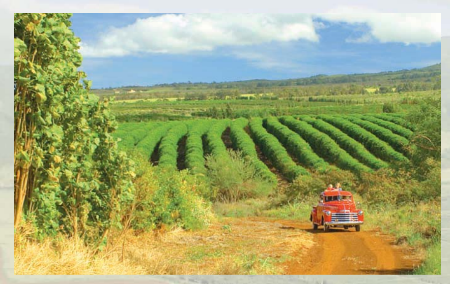
Coffee plants are harvested for their cherries once a year, starting around September. A machine designed for coffee harvesting shakes the branches to release the fruit.

or those struggling to reconcile the demands of agriculture and real estate, Ka'anapali Coffee Farms is one of the most promising experiments in home ownership on the Valley Isle.