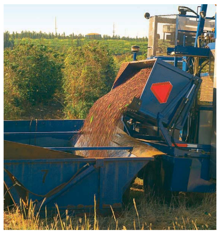
Coffee plants are harvested for their cherries once a year, starting around September. A machine designed for coffee harvesting shakes the branches to release the fruit.

MauiGrown Coffee began when Falconer leased 500 acres from Amfac JMB and Kaanapali Development Corp.