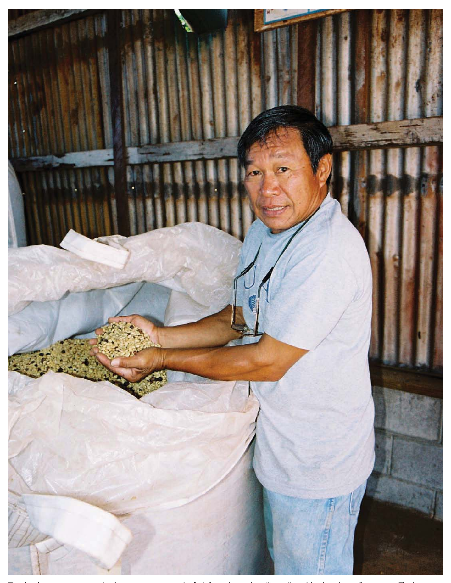
The cherries are wet processed, using water to remove the fruit from the seeds or "beans" resulting in a clean, vibrant taste. The beans are dried in mechanical dryers to ensure even drying. Green beans are then sorted and bagged in 100-pound burlap sacks, ready for roasting.